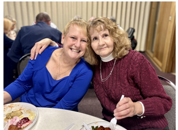
Photos from PW Thank Offering Sunday Potluck.