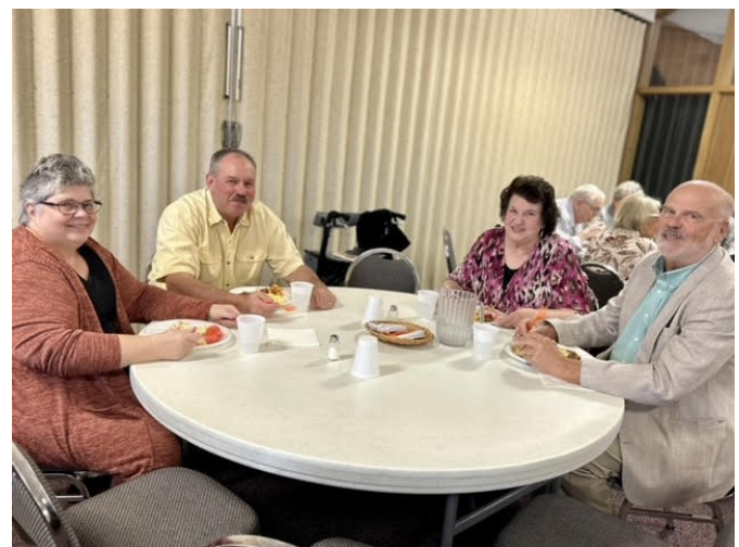
Photos from PW Thank Offering Sunday Potluck.